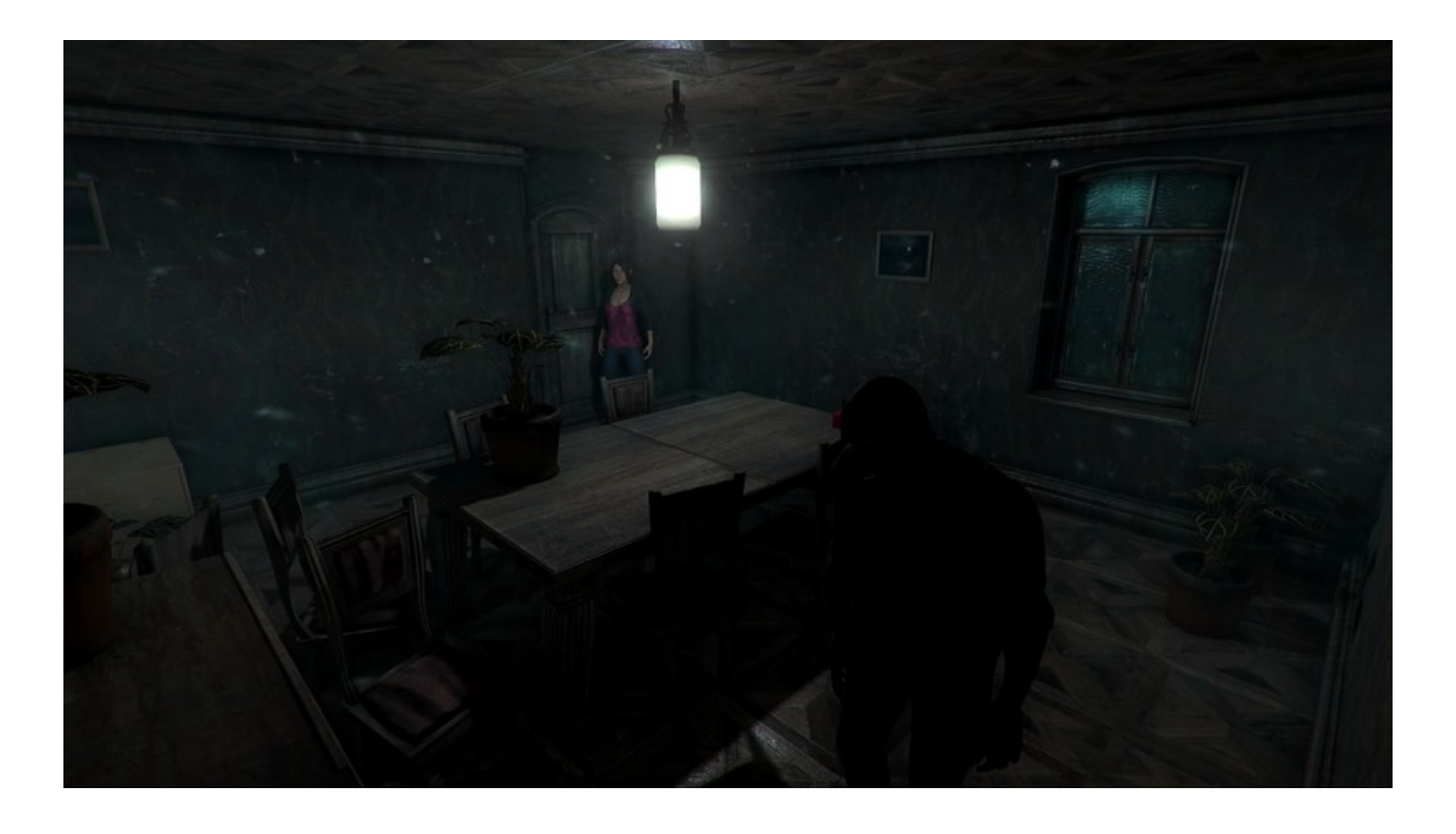
Download ->>->> http://bit.lv/2SNIxfd